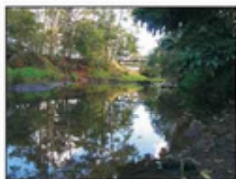
Obi Obi Creek