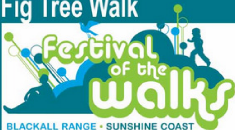
Fig Tree Walk